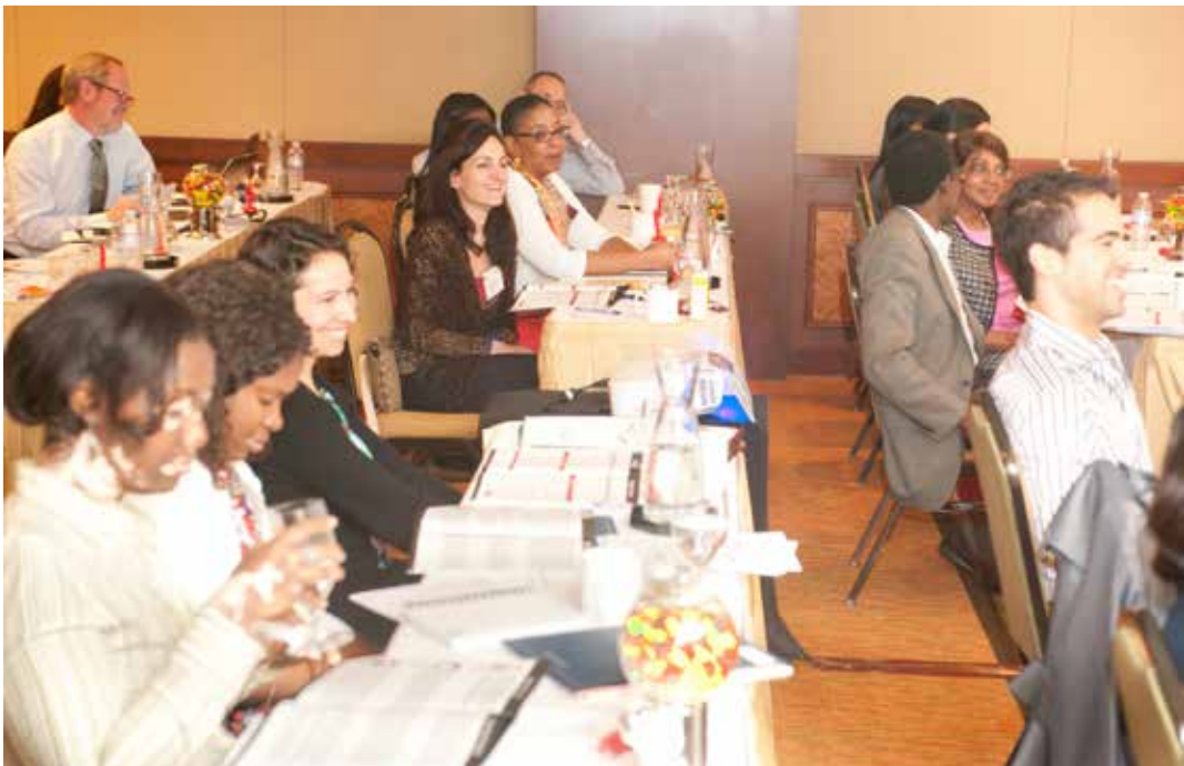
One of the lectures taking place during the first FLARE workshop in 2013.

— FAUNTLEROY SHAW IS A FREELANCE WRITER BASED IN CARMEL, IND. SHE IS A REGULAR CONTRIBUTOR TO ENDOCRINE NEWS.